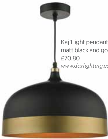
Kaj 1 light pendant matt black and gold, £70.80 www.darlighting.co.uk