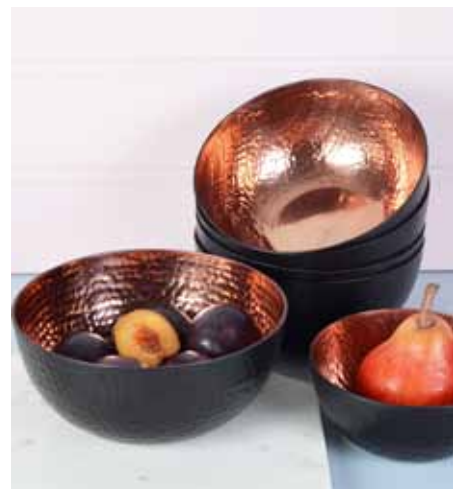
Left: Persian wallpaper, £126 www.in-spaces.com

Rich middle eastern hues of red and orange, repeating patterns and copper accessories bring light and life to the dullest of rooms. The key to its success is to decide on your main colour and then work in shades that compliment rather than contrast, or you're getting to deep into psychedelic country, and nobody wants that.