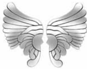
Angel wings mirror, £110 www.fibreinteriors.com